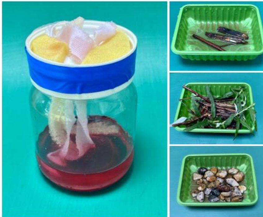
Figure 2: A small selection of possible monitoring station designs.